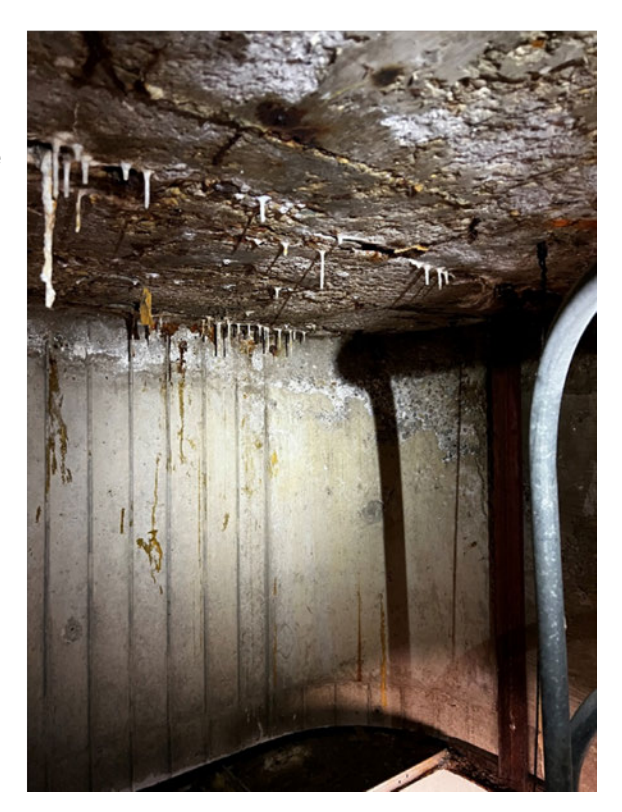
Figure 1: Slab Cracking and Efflorescence

Observations and tactile examination of the roof of the tunnel indicate that the roof is in poor condition on the west portion of the tunnel. Approximately 45 square feet of unsound concrete was observed. Tactile examination of the east portion of the tunnel roof was limited due to the hard ceiling just outside of the entrance to the Client's basement. Visual observations of the east portion of the tunnel roof indicate a fair to poor condition. Signs of deterioration of the tunnel roof slab include cracking, spalling, delaminated concrete and exposed reinforcement that has severely corroded. Signs of past water infiltration appear to be the cause of the deteriorated condition of the roof structure. This is likely due to failure of the original waterproofing system of the tunnel. A buildup of efflorescence was observed on many of the slab cracks indicating a source of water infiltration. Refer to Figure 1. A large conduit bundle on the east portion of the tunnel penetrates the slab and appears to actively be contributing to the infiltration of water. Concrete around many of the conduit penetrations were wet at the time of observation. It is probable that chlorides from de-icing salts used on the sidewalk above have infiltrated through the cover of the tunnel and have contributed to the corrosion of the tunnel roof reinforcement.