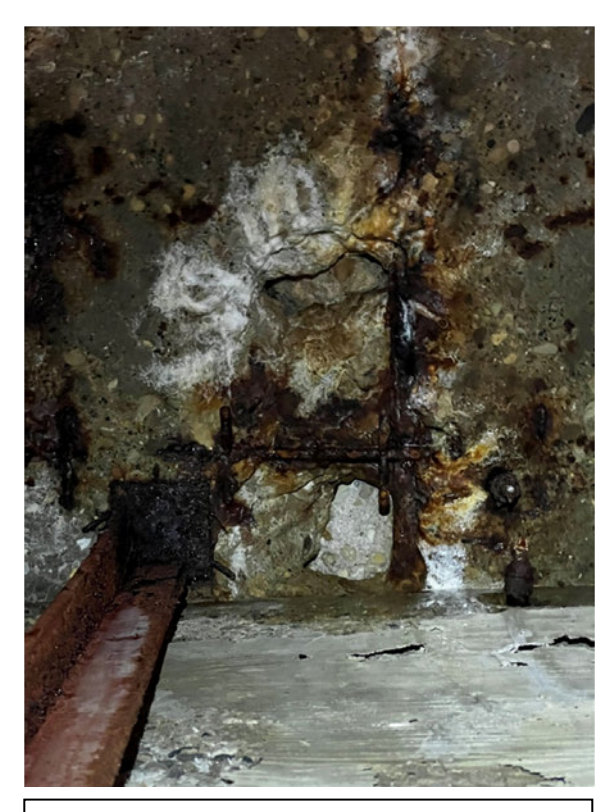
Figure 2: Hanger Attachment and Slab Spall

Visual observations of the suspended ceiling system in the tunnel indicate the suspended ceiling system is in poor condition. The suspended ceiling is supported with a structural WT shapes and angles. The supporting structure is hung from the tunnel roof by angles that are welded to plates embedded in the concrete. Refer to Figure 2. Corrosion of the angle hangers and plates have compromised the integrity of the connection that supports the gravity loads of the ceiling. Furthermore, delamination of the corroded steel members was observed. These types of deteriorations are most likely due to the presence of water containing chlorides which have likely accelerated the corrosion.